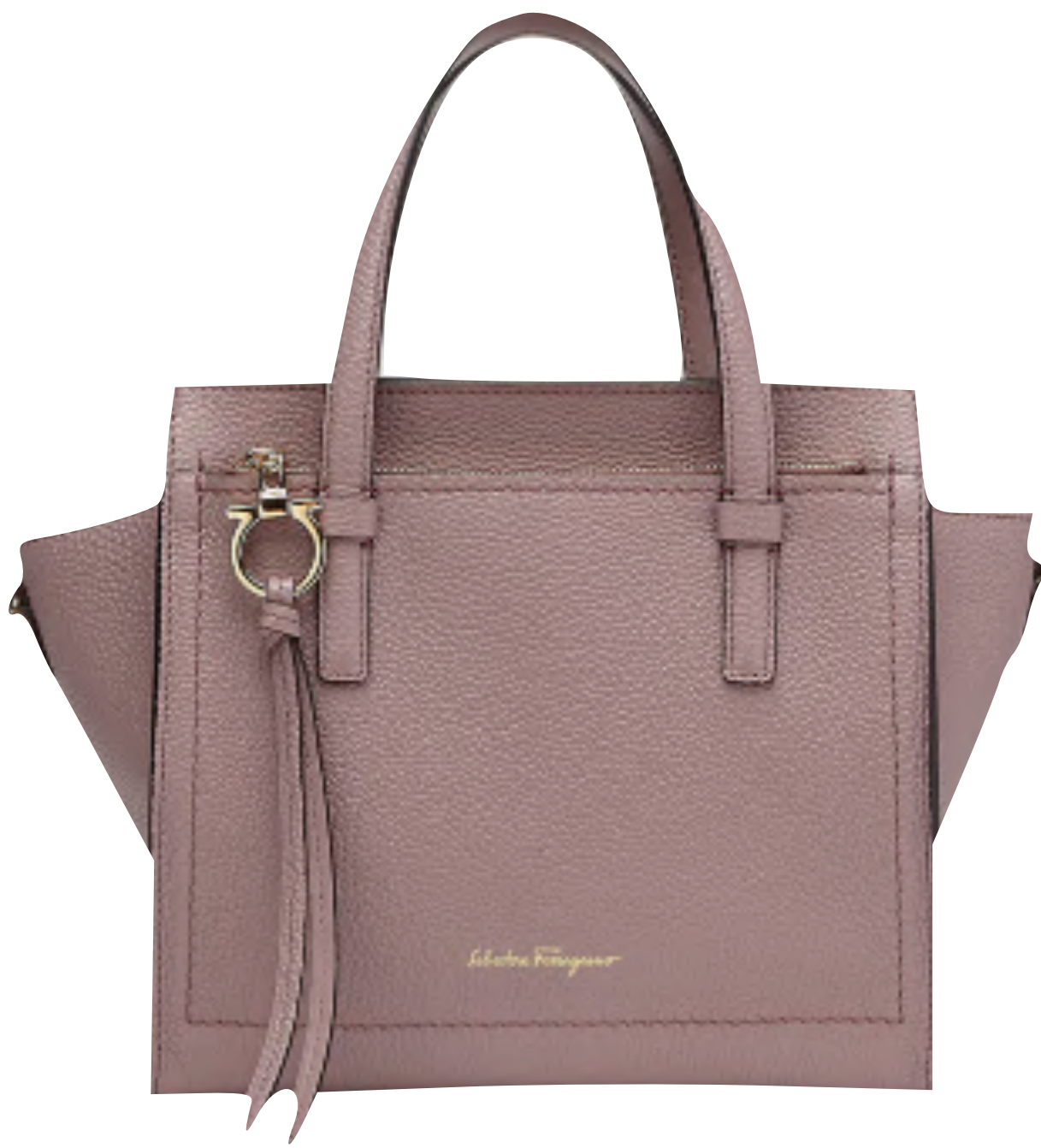
Medium Size 211381 736664 INR 1,10,000 Discounted Price: INR 77,000