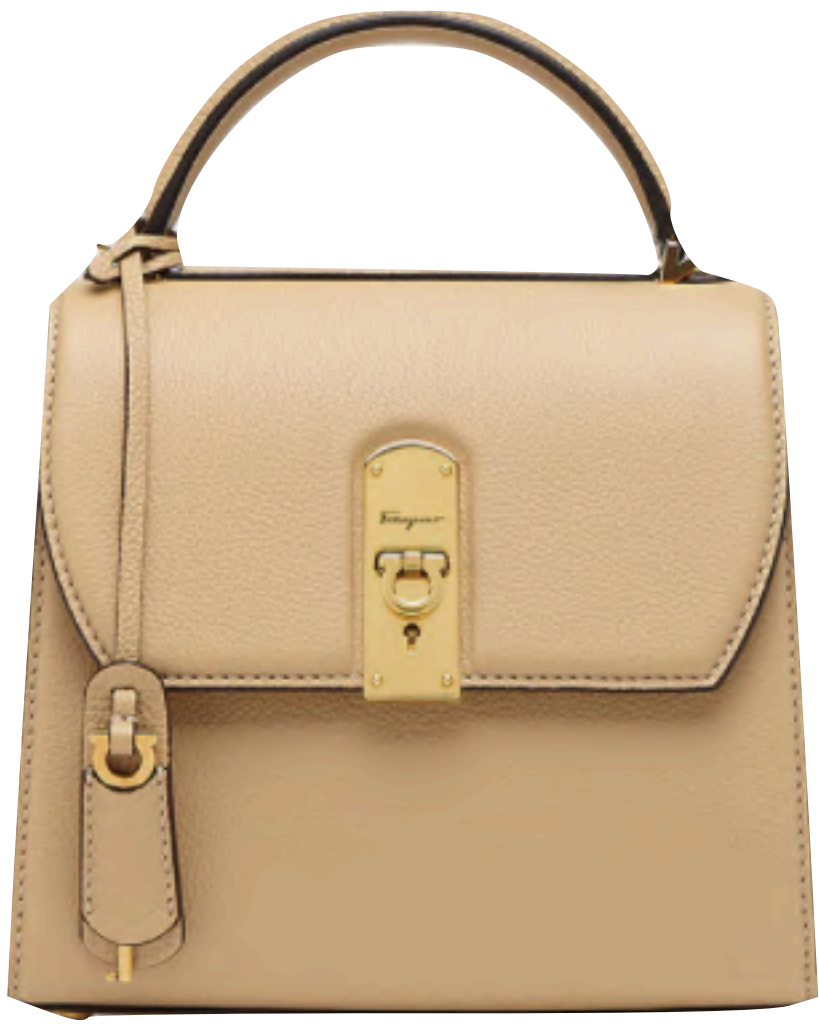
Medium Size 21H645 733528 Dune INR 1,70,000