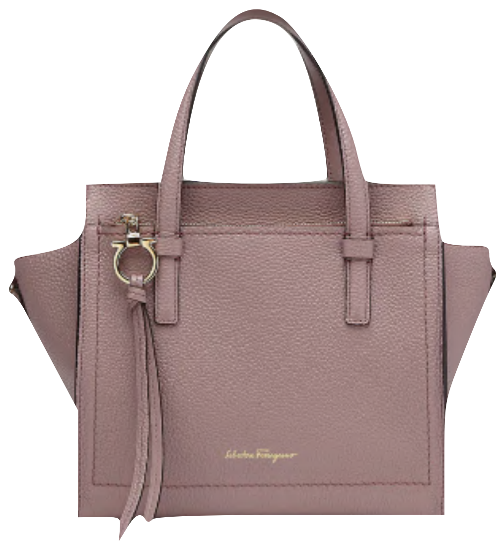
Small Size 211396 737477 INR 1,10,000 Discounted Price: INR 77,000

This elegant tote is defined by its geometric lines and boxy structure. The long top handles make this a comfortable over the shoulder tote. Comes in two sizes!