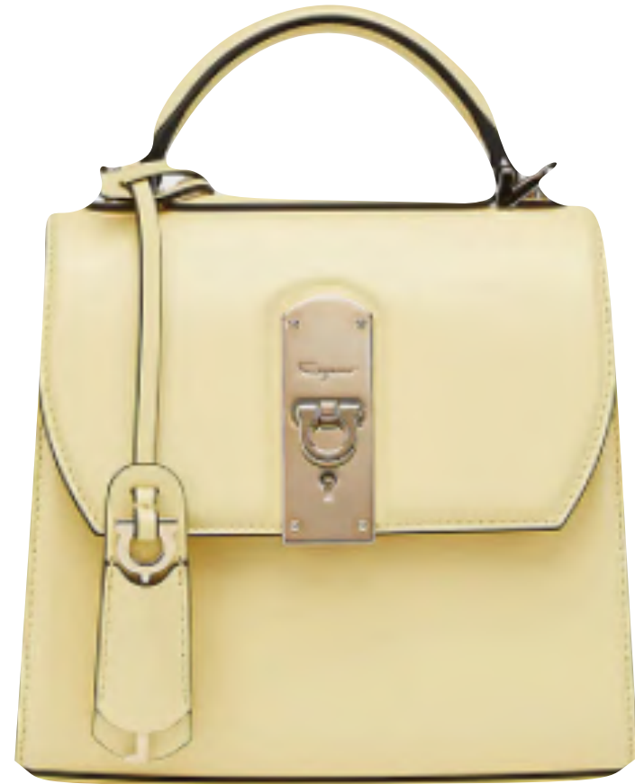
Small Size 21H647 732486 Banana INR 1,40,000